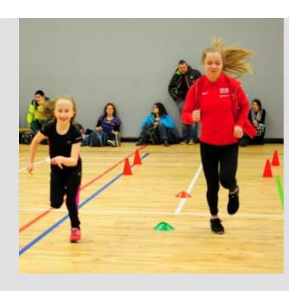
You can read more about this event on the Brightfutures blog

The Paralympics Experience Event is designed to allow young people to experience a range of Para sports delivered by some of the best clubs and coaches available in Scotland.